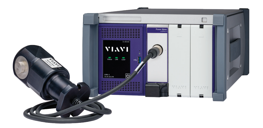
Figure 3 - Integrated Remote Head OPM in MAP-330

The VIAVI integrated remote heads feature a Teflon-based integrating sphere to minimize polarization-dependent loss and access high power. Available as a premium-performance variant and a variant specifically designed for use with MAP-PCT systems, integrated remote heads provide 90° launch and ideal spherical geometry for maximum repeatability. The integrated remote heads can measure high powers of >20dBm and 80dB dynamic range that can be used for amplifier and/or pump laser testing. They also provide a larger input aperture that is ideal for high port MPO connectors or duplex connectors. They are Measure IL for high port count MPO connectors with < 0.01dB positional variations.