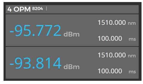
Figure 1 – mOPM MAP-300 summary view GUI

Efficient transition between summary and detailed views (figure 1 and figure 2) allow users to operate at a system level or access the full power of a module.