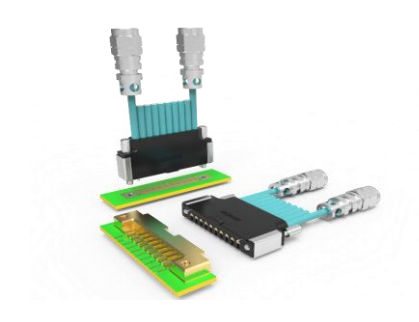
Figure 3: 8 channel coreHC to 1.85mm cable