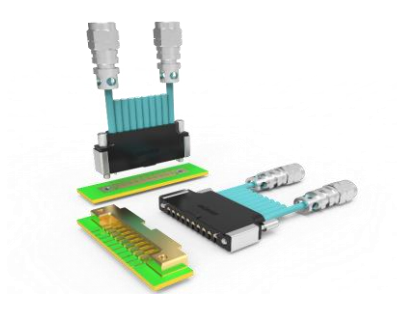
Figure 3: 8 channel coreHC to 1.85mm cable